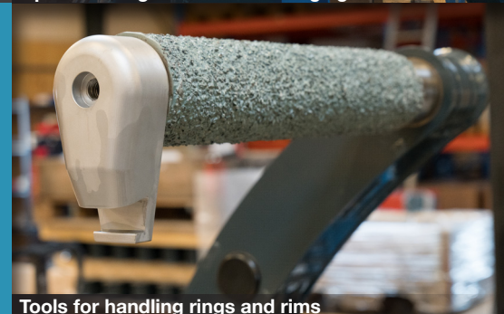
Tools for handling rings and rims