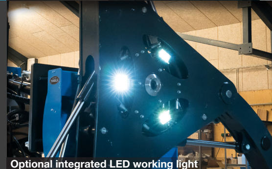
Optional integrated LED working light