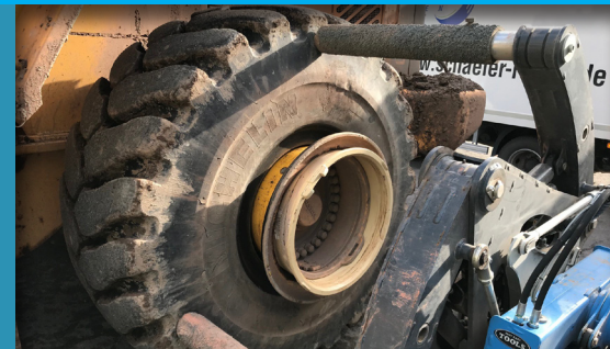
Customization on request